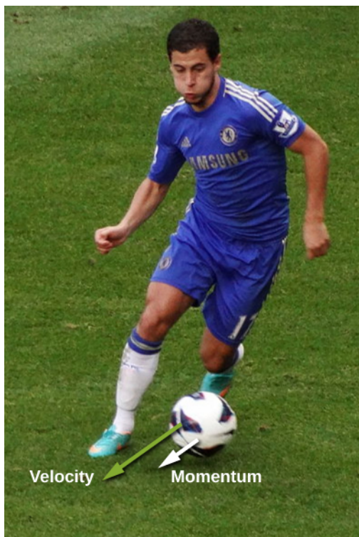
Figure 9.2 The velocity and momentum vectors for the ball are in the same direction. The mass of the ball is about 0.5 kg, so the momentum vector is about half the length of the velocity vector because momentum is velocity time mass.

As shown in Figure 9.2 , momentum is a vector quantity (since velocity is). This is one of the things that makes momentum useful and not a duplication of kinetic energy. It is perhaps most useful when determining whether an object's motion is