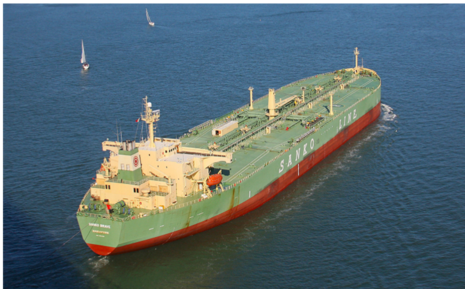
Figure 9.3 This supertanker transports a huge mass of oil; as a consequence, it takes a long time for a force to change its (comparatively small) velocity.

difficult to change ( Figure 9.3 ) or easy to change ( Figure 9.4 ).